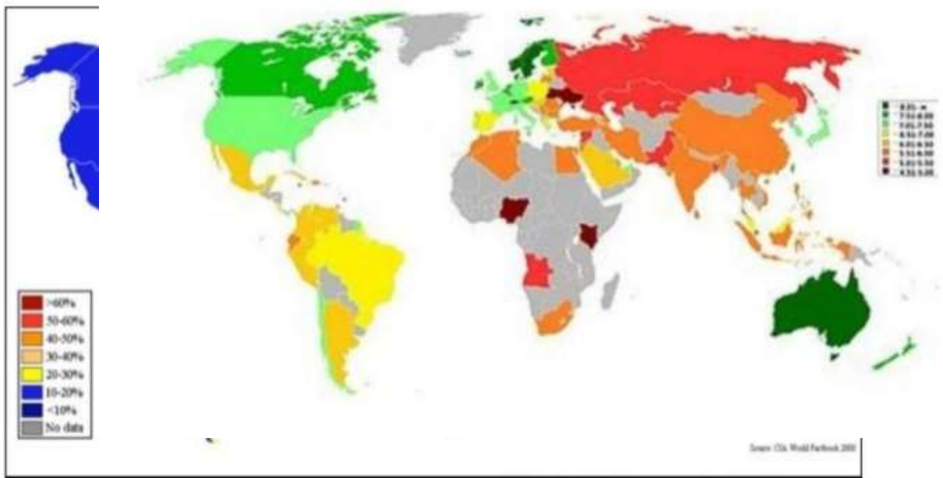
Удельный вес населения с доходами ниже национальной черты бедности (по данным ЦРУ, на 2008 год).

The Human Development Index was calculated in 2013 (from the Economic Intelligence Unit) and includes 80 countries, with Switzerland,