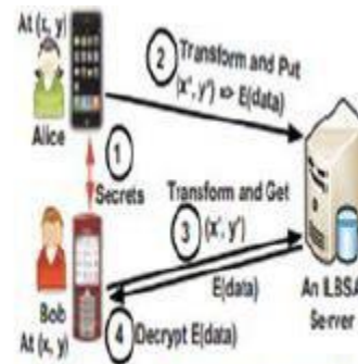
Figure 1: A Basic Design of Locx

malicious server to destruct a user's location privacy.