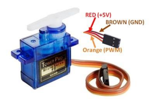
Fig 3 : SG-90 Servo Motor