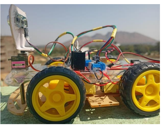
Real picture of the robot

The obstacle avoidance robot's Arduino results are acquired by moving the robot ahead, detecting obstacles, checking for more directions, and moving. When there are no impediments, it travels ahead; an ultrasonic sensor is used to detect obstructions. The ultrasonic sensor was rotated by a servo motor.