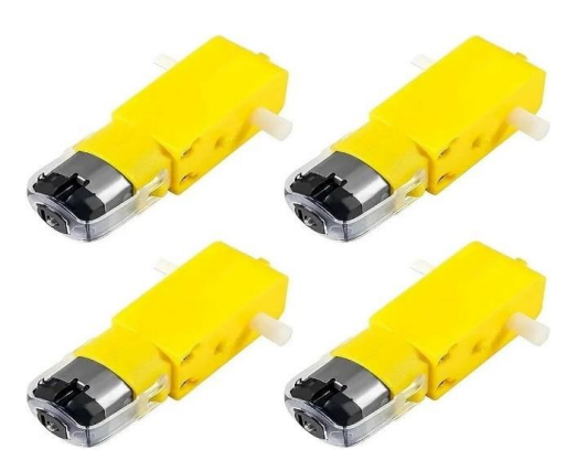
Fig 4 : DC MOTORS

An electrical gadget that turns and changes coordinate current (DC) electrical vitality into mechanical vitality is called a engine. A coil or inductor when DC control is presented