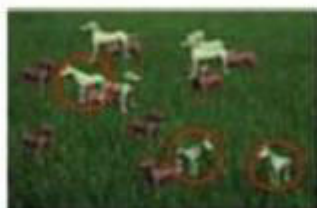
Fig. 3. Captcha Zoo with horses circled red.