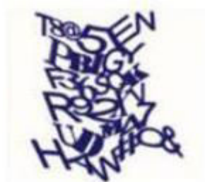
Fig. 2. A ClickText image with 33 characters.

different views, textures, colors, lightning effects, and optionally distortions. The resulting 2D animals are then arranged on a cluttered background such as grassland. Some