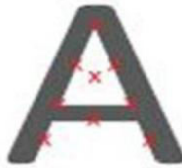
Fig.5. some invariant points (red crosses) of "A". Clickable points in TextPoints are salient points of their characters and thus help remember a password, but cannot be

Authentication: When creating a password, all clickable points are marked on corresponding characters in aCaRP image for a user to select. During authentication, the user first identifies her chosen characters, and clicks the password points on the right characters. The authentication server maps each user-clicked point on the image to find the closest clickable point. If their distance exceeds a tolerable range, login fails. Otherwise a sequence of clickable points is recovered, and its hash value is computed to compare with the stored value