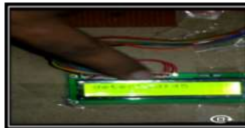
Fig. No alcohol Contents