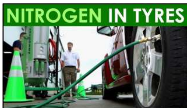
Fig. Nitrogen in tyre