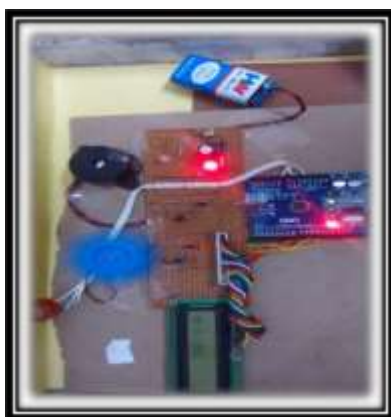
Fig. No alcohol Contents

The alcohol device that is connected to port one,3rd pin has wood spirit share. Whenever the alcohol share of the motive force exceeds the limit of alcohol device, then the ignition(motor) that is connected to port one,0 stops mechanically. A message showing "Detected" is displayed on the digital display that is connected to port zero. At constant time buzzer that is connected to port one,5th pin is ON acting as a warning to the motive force. If the alcohol share of the motive force doesn't exceed the device alcohol content, then a message "no alcohol motor on" is displayed on the digital display screen.