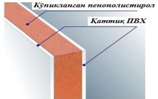
Figure 2. Sandwich panel made of rigid PVC

PVC sheets (Fig. 2) are light, resistant to chemical effects, do not burn in air, and have thermoplastic properties. But due to low resistance to freezing (up to -15 0C) and heating (+up to 65 0C) and mechanical impact, it is used only in closed rooms.