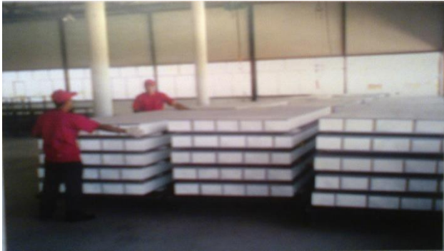
Figure 4. Cement sandwich panels produced by "SAM ROS KHOLOD" LLC in Samarkand.

Cement sandwich panels are 3000 mm long, 950 and 1150 mm wide, and 90 mm to 150 mm thick. These panels are intended for the construction of residential buildings, kindergartens and nurseries, schools and other social and household buildings.