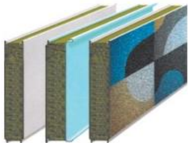
Figure 1. Appearance of sandwich panels.

"Sandwich" type panels are usually called three-layer wall panels (Fig. 1). In them, the thermal insulation layer is covered with sheet materials from both sides. Aluminum, galvanized steel sheets or OSB plates are used as covering. Materials such as mineral wool, expanded polystyrene, expanded polyurethane are recommended as thermal insulation. The thermal protection level of such walls is high.