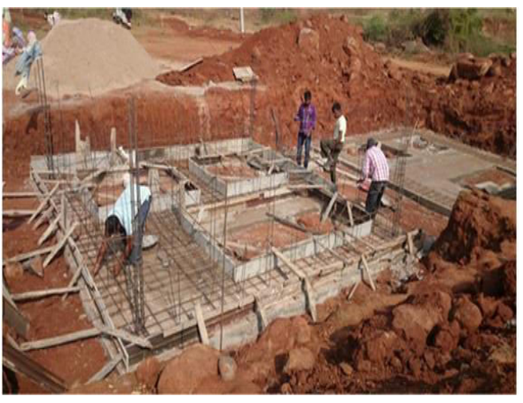
placing reinforcement for raft foundation