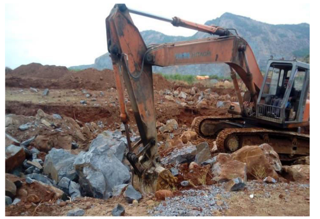
Site clearing with Proclain