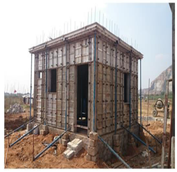
Scoff holding & centering