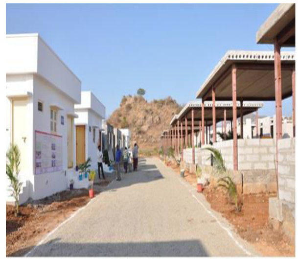
Final view of building site