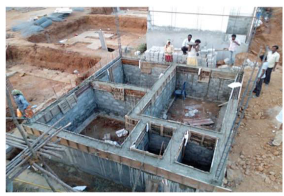
Basement up to plinth level