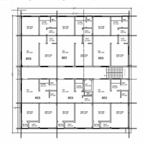
FIG 5.1 BUILDING VIEW OF PLAN STRUCTURE DATA

This chapter provides model geometry information, including items such as story levels, point coordinates, and element connectivity.