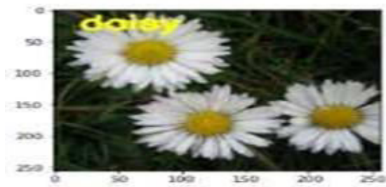
Figure 2 Acc: 95.3

Color Histogram that measure color of the flower.