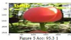
Figure 5 Acc: 95.3 1