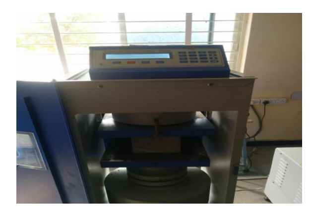
Fig: 7.2 Compressive Testing of SCC Cube Using Digital Compression Testing Machine

Table: 7.1Workability Parameters for M_{40} Grade SCC