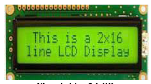
Fig - 4 : 16 x 2 LCD.

The LCD (Liquid Crystal Display) is the visual interface. It shows information in a clear, easy-to-read format. It's like the screen on your phone, but in this case, it displays messages about alcohol detection and safety status for the driver.