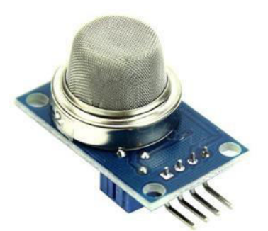
Fig - 3: Gas Sensor

A gas sensor is a device which detects the presence or concentration of gases in the atmosphere. Based on the concentration of the gas the sensor produces a corresponding potential difference by changing the resistance of the material inside the sensor, which can be measured as output voltage. Based on this voltage value the type and concentration of the gas can be estimated.