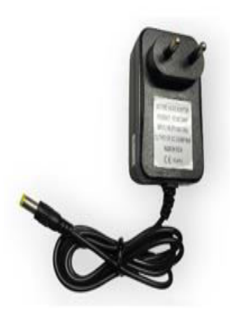
C. 16 x 2 LCD

The power supply plays a vital role by furnishing electrical power to all electronic components. It meticulously delivers the precise voltage and current required for optimal operation, including sensors and displays. It serves as the essential electrical source that sustains the functionality of the entire system.