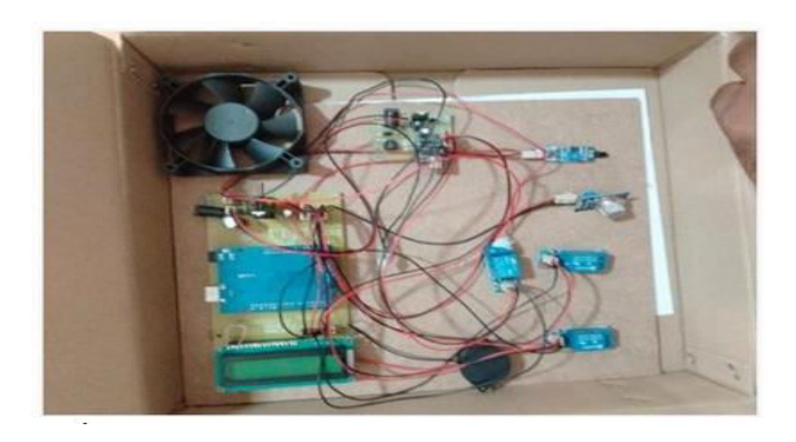
Fig - 9: Final Prototype of Home Automation SystemUsing IOT