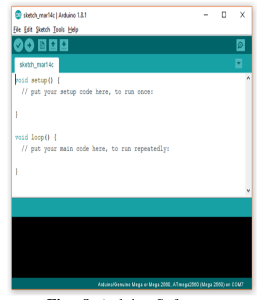
Fig - 8: Arduino Software.

The Arduino Integrated Development Environment (IDE), also known as Arduino Software, provides a comprehensive platform for Arduino microcontroller programming. It includes a text editor for code writing, a message area for status updates, a text console for communication, and a toolbar with common functions. Arduino code is referred to as "sketches" and is saved with a .ino file extension. The IDE also offers libraries for code modules, supports third-party hardware, and features a serial monitor for debugging and real-time data exchange, streamlining the development process.