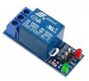
Fig - 2: Power Supply.