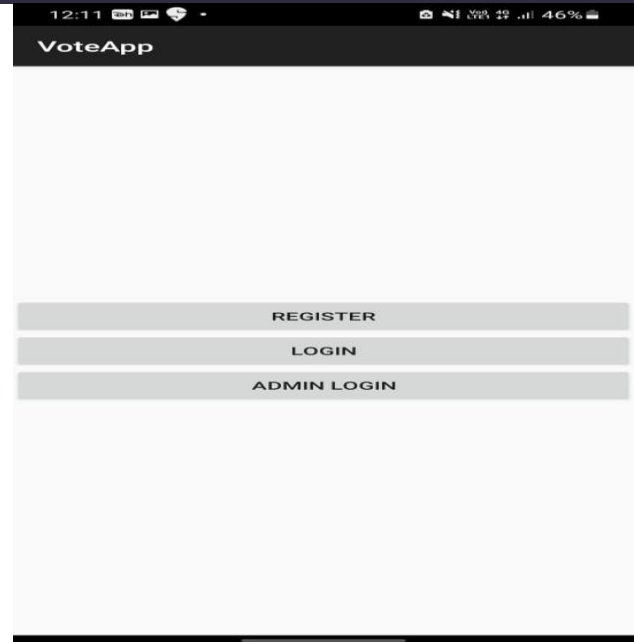
Figure 5.1 Home page

The voter registers to cast a vote to the list of candidates using phone and Aadhar number. After successful registration user login to the interface and cast his vote to his respective candidate as shown in Figure 5.1.