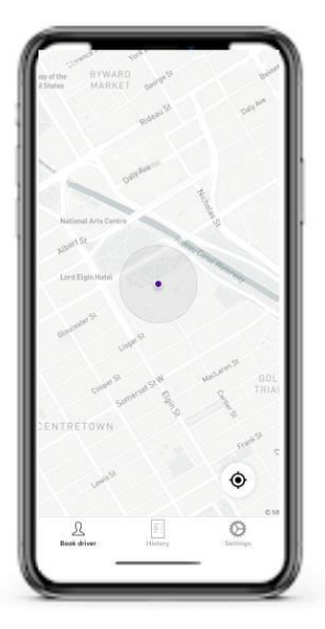
Figure4 : Location Screen