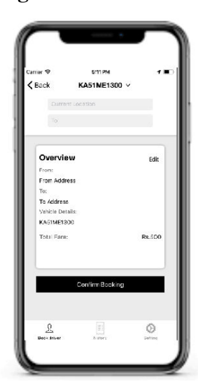
Figure5: Booking Status