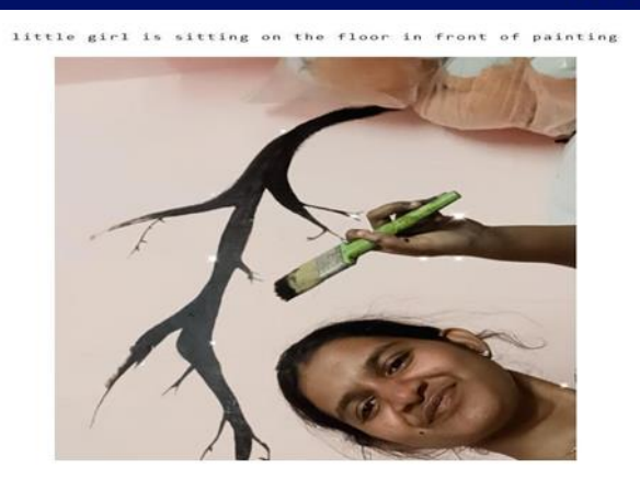
Fig 6 Beam search caption