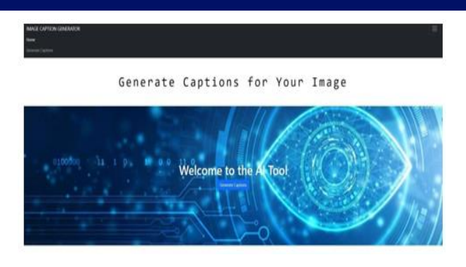
Fig Home page