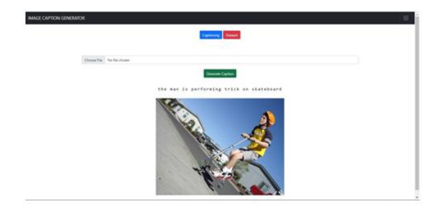
Fig 5 Beam Search Caption 1