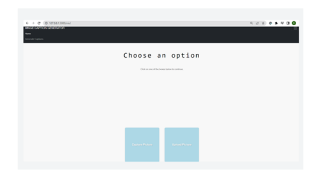
Fig 4 Image upload