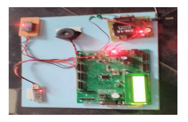
Fig 2 kit Diagram