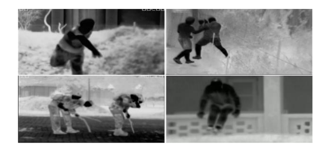
Fig. 4. Grid of images represents different human activities. Top left shows man throwing, top right shows men crossing fence, bottom left shows man lying and the bottom right shows man jumping from the wall.