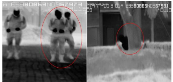
Fig. 2. Left image shows person being occluded due to movement in the group and the right image shows person hiding behind the tree getting occluded.

inconsistencies. Removing them improved the model's ability to generalize to new, unseen data. Further, we also aim to reduce bias. Bias can result from the inclusion of unsuitable images. Data cleaning also reduced bias, ensuring fair and accurate predictions. After the pre-processing and data cleaning we were able to reduce down to 85,000 images.