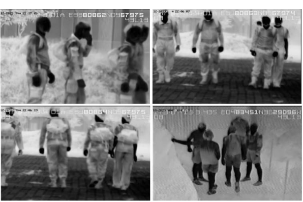
Fig. 1. Grid of images represents various human activities being captured from multiple views. The top left image shows the side view, top right shows front view, bottom left shows back view and the bottom right shows the top view.

It also solves the problem of concealment to a large extent. For example if a person is approaching you by hiding his weapon underneath his clothes, the heat signature of the weapon will be caught by the thermal camera, and it will be able to reproduce its shape. To make it more practical many such activities have been made the part of the dataset. To make the dataset more robust to occlusion, situations have been created in which person is either occluded behind a natural obstacles (tree, tall-grass, walls etc) or his activity is being occluded due to movement of group of men. To deliberate upon the details and to have a clear differentiation all activities were captured in slow, medium and fast motion.[12] These videos were captured in varying background as well like plains, tall-grass patches and urban areas. To add more variability and to break the shape of the silhouette, human activities were recorded in different dresses like shirt & pants, military dress, t-shirts & shorts and long kaftans.