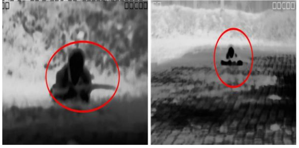
Fig. 3. Left image shows a man crawling with weapon captured using 3x zoom and the right image shows similar activity in 1x zoom.

6) Data Documentation: Firstly, a metadata file is created that contains information about each image such as file names, labels and other additional annotations. Secondly, A detailed dataset description is carried out that includes information about dataset purpose, source and other specific details about the activities. Dataset is securely stored at multiple places and backed up to prevent data loss. Further, it is password protected to prevent any unauthorized access.