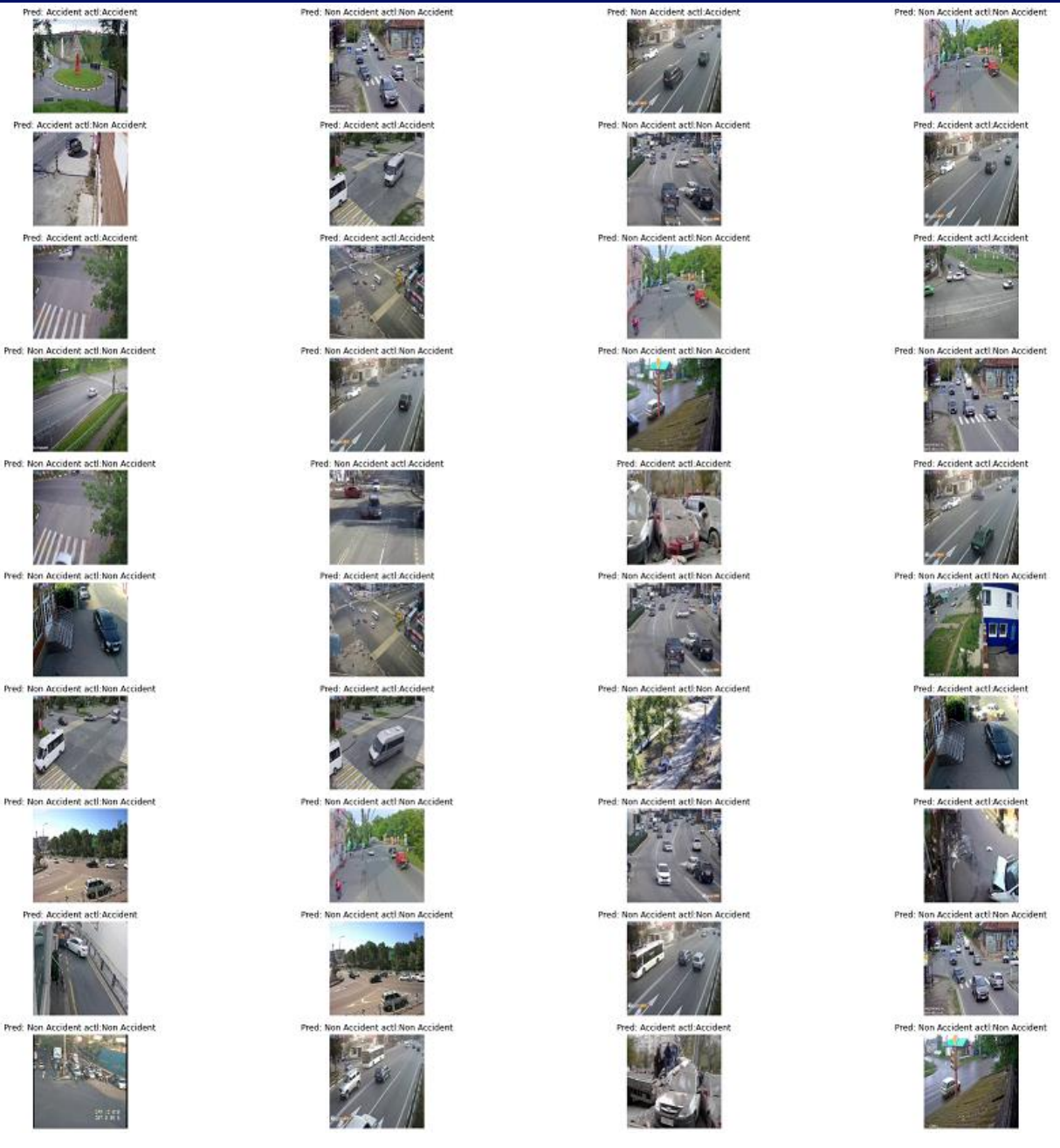
Fig5. Outcome of the Research

By presenting the accuracy percentage in a clear and understandable manner, the system empowers users to make informed decisions based on the level of confidence in the detection results. Such a user-friendly interface enhances the accessibility and usability of the system, catering to a wide range of users with varying levels of technical expertise. Ultimately, this real-time detection capability not only streamlines the accident detection process but also contributes significantly to bolstering road safety measures, thereby fostering a safer and more secure transportation environment for all road users.