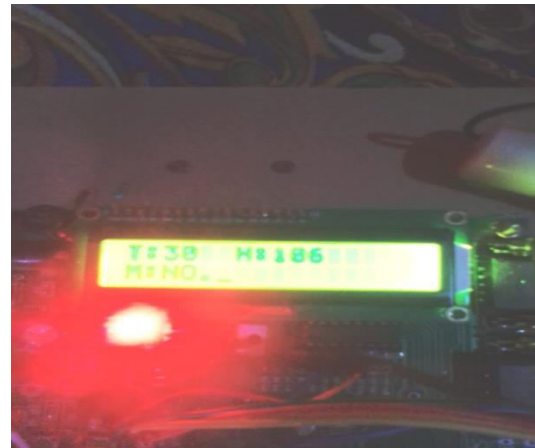
Fig 5.2: Output Values