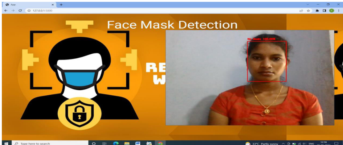
Fig 5:with out mask