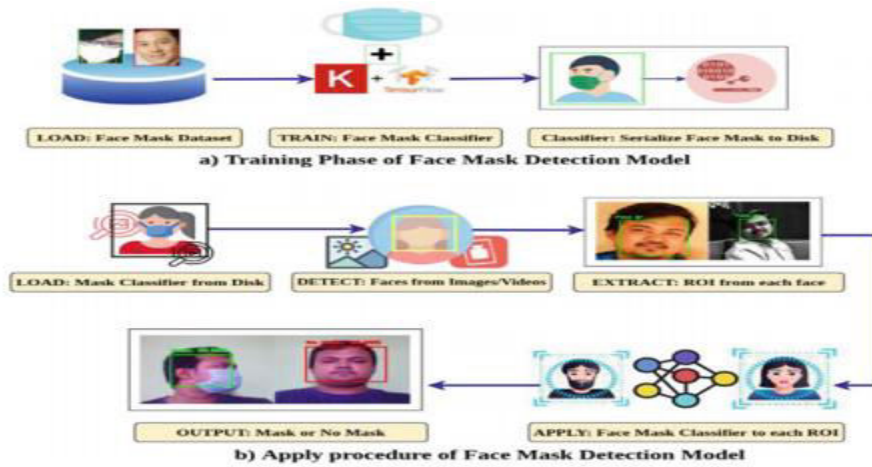
Fig. 3 Multiple stages and detailed phases for the development of a face mask detector model (images by the authors) a represent the training phase of face detection model whereas b shows how the apply procedure works in face detection model

TensorFlow libraries. In addition, a two-step approach is used to recognise face masks in both still images and live video feeds. Following Fig. 3, we provide our suggested two-part COVID-19 Face Mask Detector Model technique.