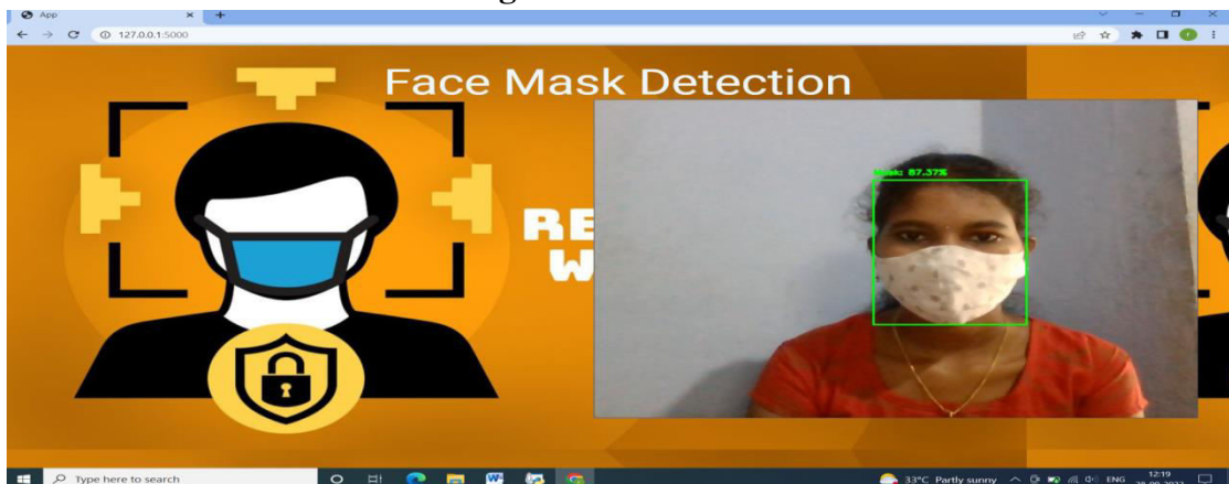
Fig 6:with Mask

Detecting face masks or without face mask in real-time from a video stream