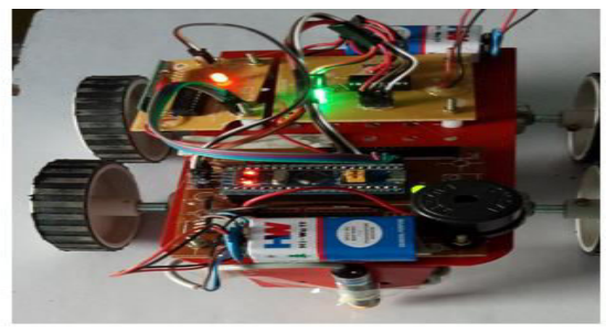
Figure 3: The Implemented Prototype Kit.

While robot is moving if any metal is detected in its path, the robot stops there ringing the buzzer. Again, it starts moving when the commands are sent from the transmitter.