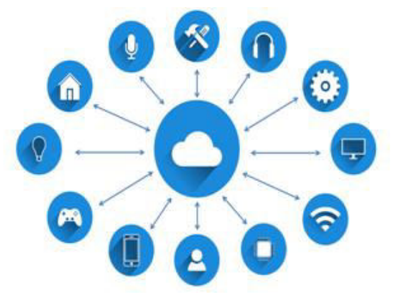
Figure 1: The Basic IoT Architecture.

improvised explosive devices, a $106.5 million push.