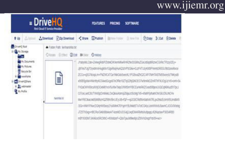
Fig 3: Encrypted medical record

user-friendly interface has An been developed to see the practical efficiency of the proposed system. The project is run on Windows 10 of Intel Core i5 processor of 2.40GHz with 8GB memory. We have implemented our scheme in Java/J2EE, the IDE used is Netbeans8.0.1 and the database is used MYSQL. Shamir's Secret Sharing Scheme is employed here to securely split the secrets, which is a built-in function in Java and MD-5 is applied for the hashing function.In our system, the medical report will get uploaded in the cloud. The EHR will be encrypted and stored in the cloud to avoid security threats. The EHR will bedecrypted whenever it has to be downloaded by the user