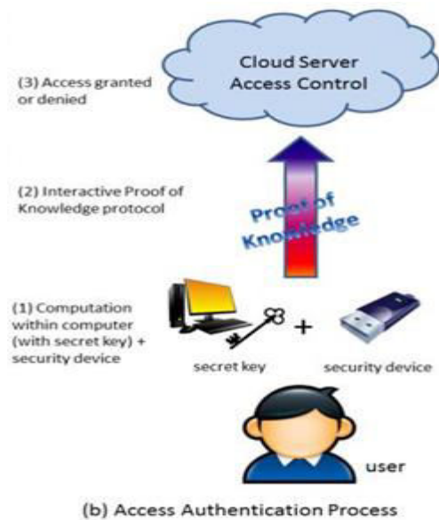
Fig 1: Proposed System Architecture: