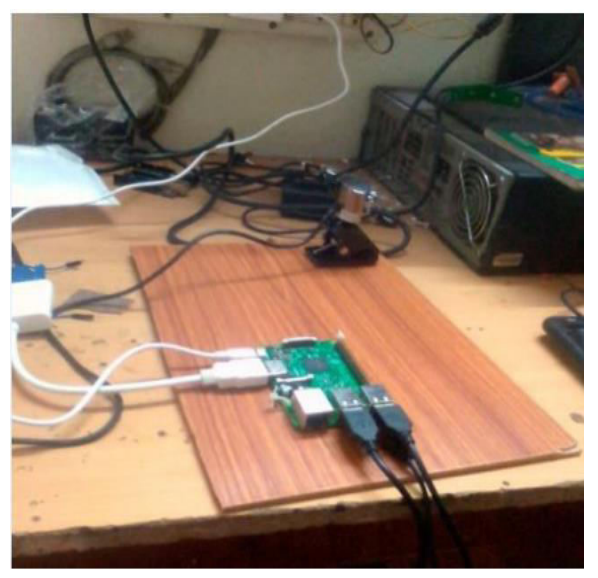
Fig. 2: HARDWARE IMPLEMENTATION