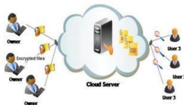
Fig.1. System Architecture for PMR Sharing

access the file. In professional domain PMR file accessible to the user if he satisfies access policy given for the each attribute authority. Each attribute authority in system governs disjoint subset of user attributes. We are using MA-ABAC policies during encryption .Owner is free to set different policies. Owner can add/delete/modify the policy also they can dynamically change the policy. Our system also supports user revocation. User who wants file send a request as keyword to the cloud server they will get a file only when they satisfy the access policy set by the owner