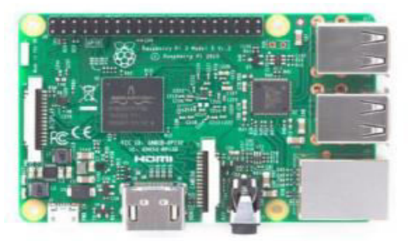
Figure 5: Raspberry Pi 3

Figure 4: LM 358 pin configuration Raspberry Pi 3: The Raspberry Pi 3shown in Figure 5 is a low cost, powerful processor. It facilitates on the operating voltage of 5 V. It can facilitate the user with all the features that are provided in the personal computer. The Raspberry Pi 3 acts as a central server and also as a gateway for protocol conversion that is from wired to wireless. The Raspberry Pi3 is programmed using Python programming language. All the information from electrical appliances is transferred to the Raspberry Pi with the aid of intermediate circuitry to achieve high efficient computations and data communication.