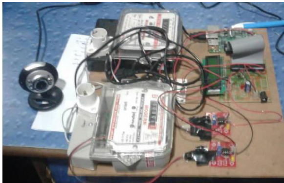
The Raspberry Pi 3 provides a supply of 5 V but the electrical appliances in general operates on 230 V. So relays are employed in this system for voltage conversions and also to remotely ON and OFF the electrical appliance. The energy consumed by the two

The Figure 8 represents the experimental setup of the system and the working principle of the system is explained below. The Home Automation system developed is employed with energy management and security system. In this system, the implementation is done to control and monitor two electrical appliances. The devices used in this system are two electrical appliances, two energy meter, two relay integrated with Optocouplers, LM 358 IC, Webcam, Raspberry Pi 3.