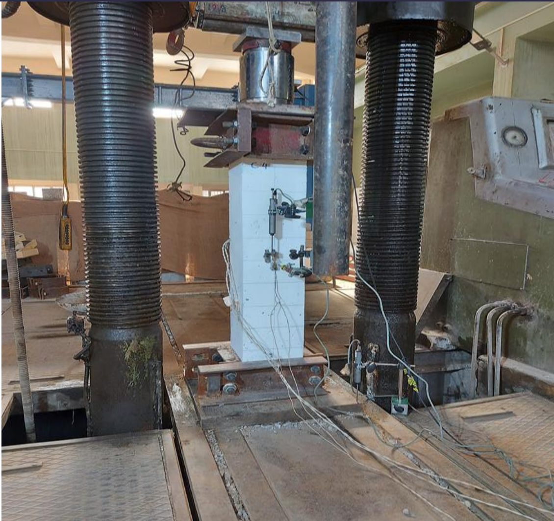
Fig. 2: Testing of column specimens